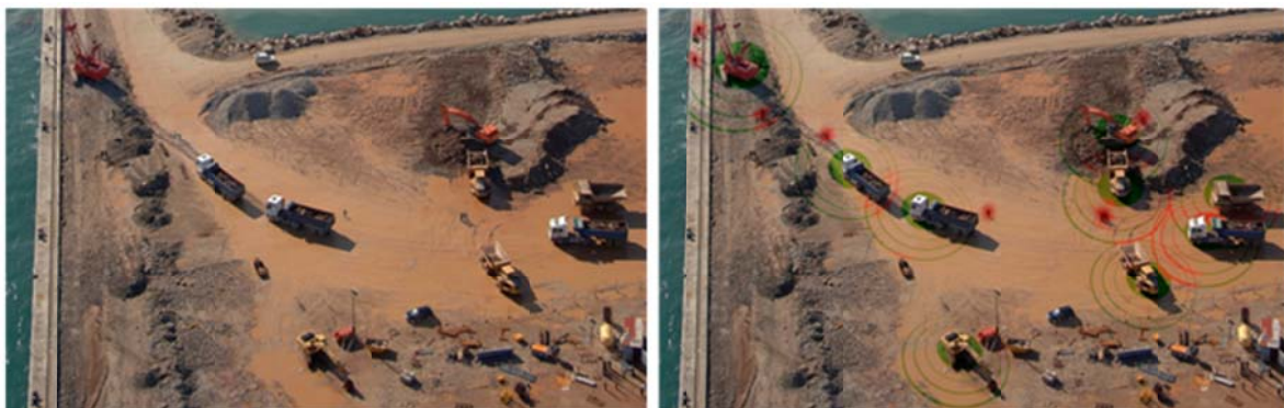
Figure 1 Implementation of the centralised LINEO system in the work site machinery.

In order to solve the problems described above, during the initial stage of the project an analysis of the different technological solutions was performed. After this analysis and taking into account the characteristics of the work environment, it was decided to develop a centralized tracking system in which the elements identified as critical, in this case the machinery, will be equipped with a number of detection devices that allow anything moving around it (operator, machine, etc.) to be detected and located without the need of carrying any specific device (passive subject model). To our knowledge, there are no technological solutions that can solve the requirements of this problem in a work site environment.