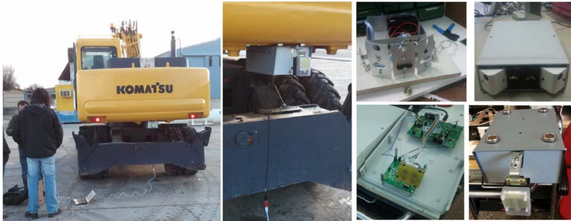
Figure 2 Tests performed with the different sensing modules developed

modules integrate ultrasonic sensors for short distances (up to 4m) and Doppler radars for medium and long distance (up to 10m).